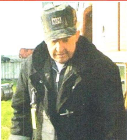
Do you remember this firefighter? 1969-2003 (34 year)

Hope to see you at the Open house July 21, 2018 Adult $10.00 Under 12 $4.00 Under 5 free Homemade Ice Cream